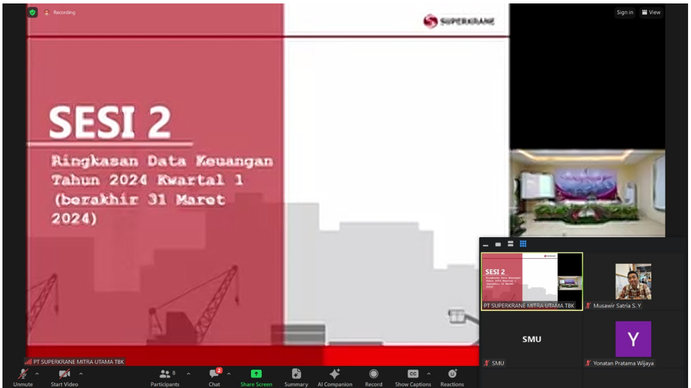
Screen shot of Slide presentation of Zoom Meeting