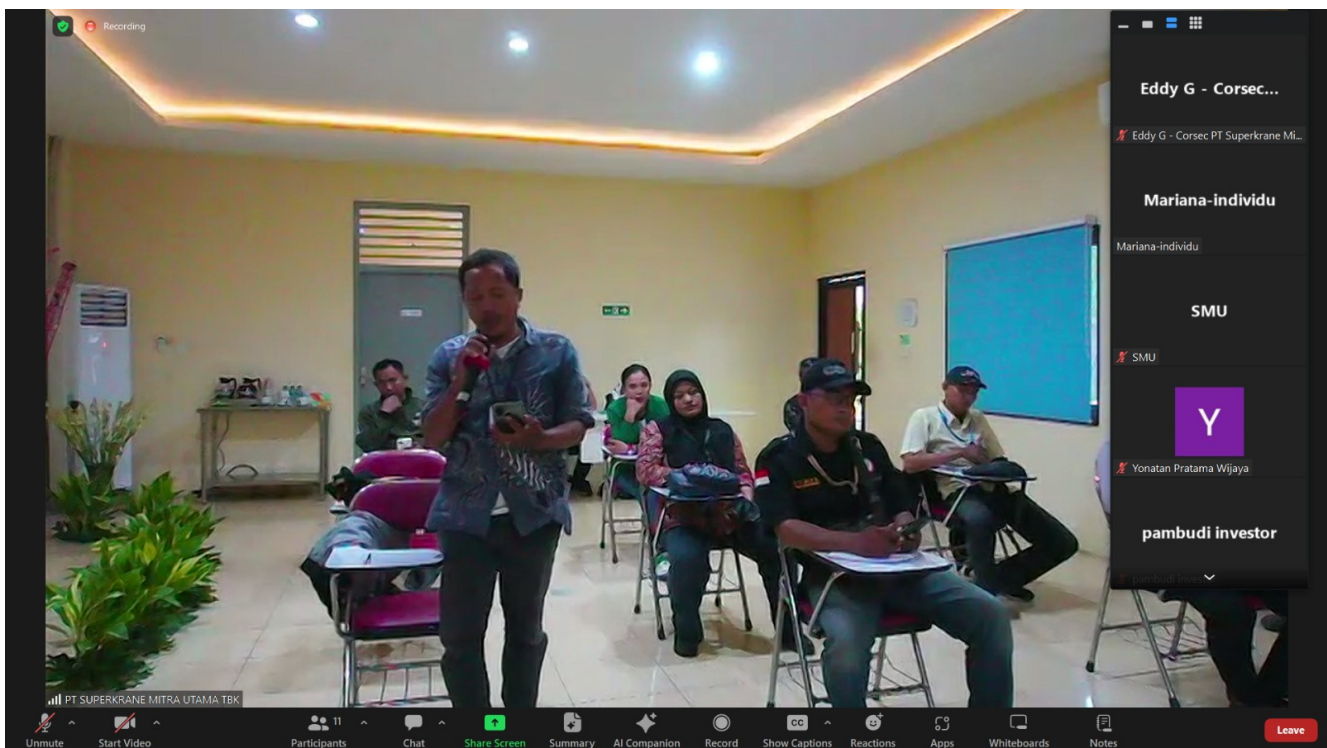
Question and Answer sessions – question from one on-site participant